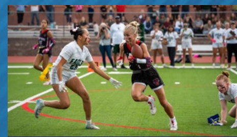
FHS, CHS Face Off in Historic Flag Football Game... Page 7