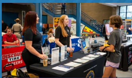
College and Career Expo a Success... Page 5