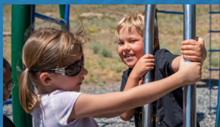
Super Summer at Kinsey... Page 6