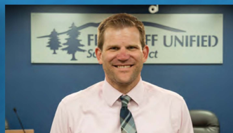
Cirzan Appointed to FUSD Governing Board... Page 2